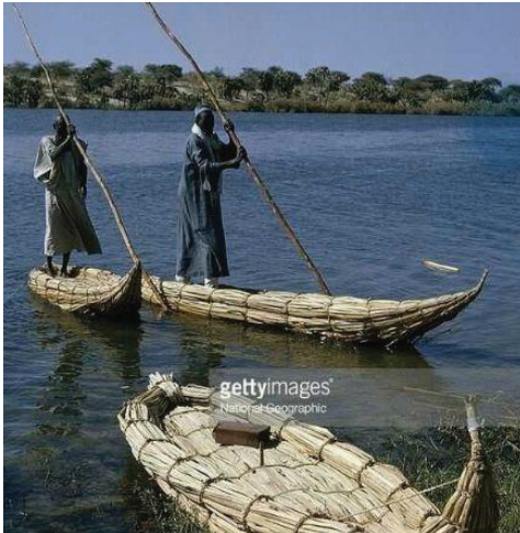
Fig. 3 Cultural Inland Fishing Implement, Tacht Canoe