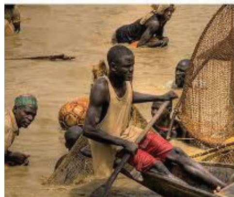
Fig. 1 Cultural Fishermen in Fishing Act

This result aligns with the findings of Withanage, and Lakmail Gunathilaka, (2023e).