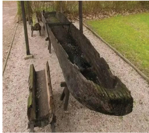
Fig. 4 Traditional Ecological Knowledge (TEK) Transformation of Fishing Implement (Canoe) in the Study Area, Dugout Canoe

This result corroborates those of Houde, (2007b).