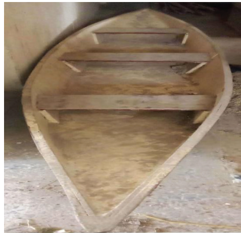
Fig. 2 Cultural Inland Fishing Implement, Wooden Canoe

This outcome is consistent with those of Rai and Mishra, (2022).